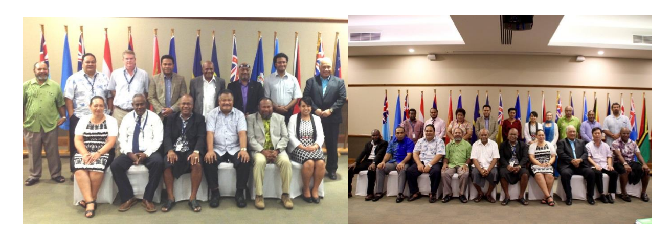
PIDF Executive Board and Senior Officials Committee