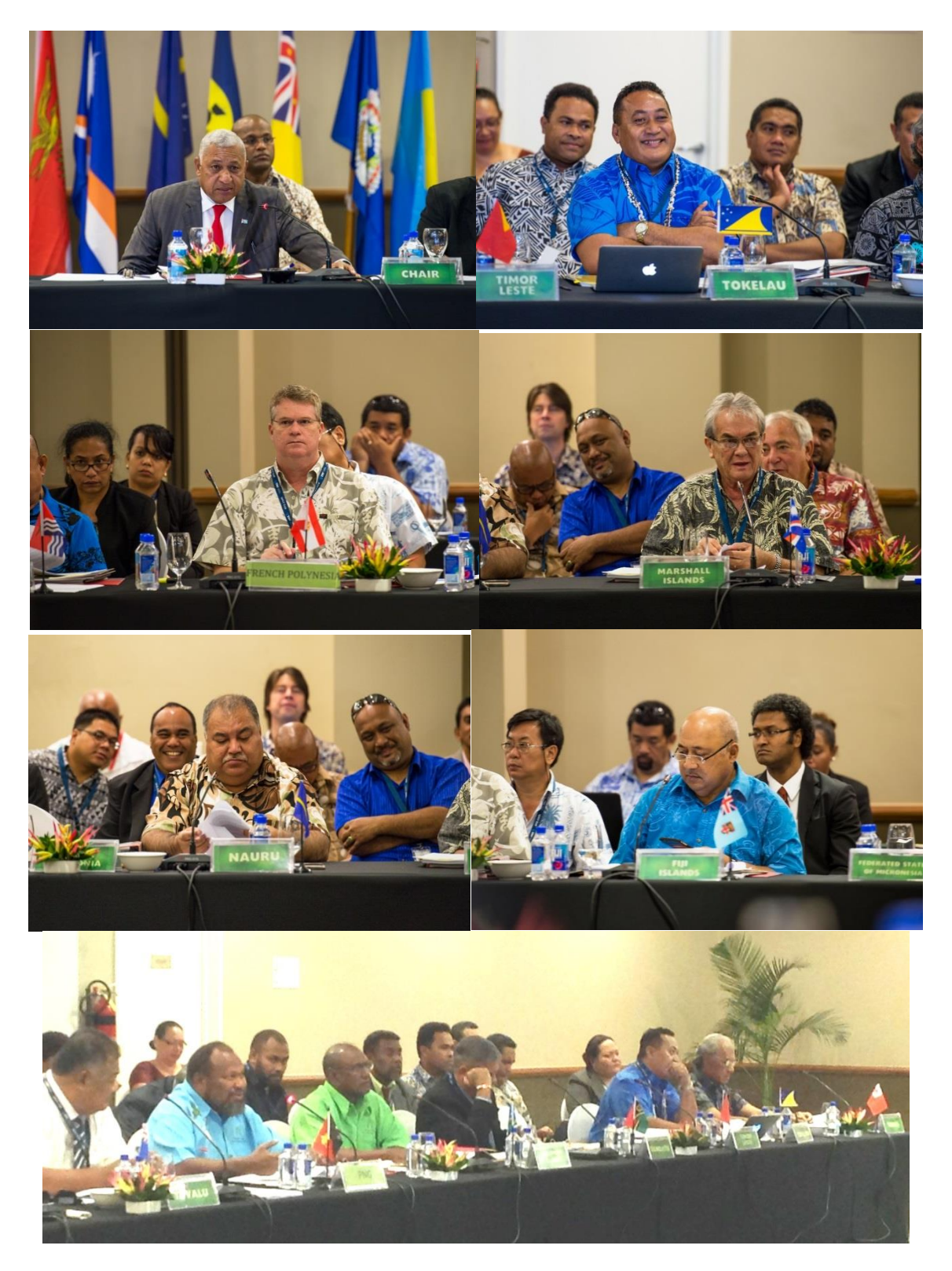
Meeting of the Governing Council